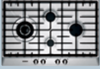
30" Gas Cooktop