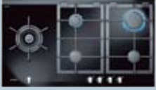
36" Ceramic Gas Cooktop