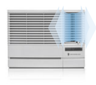
AUTO AIR SWEEP swing louvers for even air distribution*