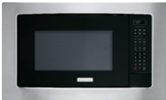
Microwave shown with Stainless Steel Faceplate