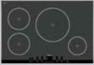
30" Induction Cooktop