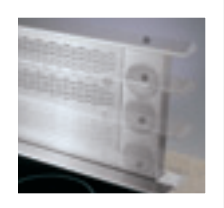
48", 46", 36", 30", DOWNDRAFT E48DD75ESS, E46DD75ESS, E36DD75ESS, E30DD75ESS