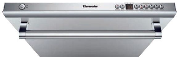
6-program stainless steel dishwasher with Professional handle

Also available with Classic Professional handle, Masterpiece handle or fully integrated.