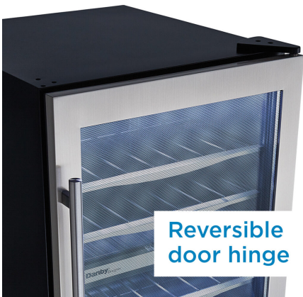
Reversible door hinge