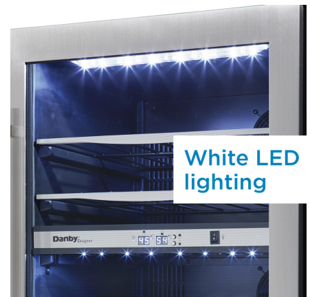
White LED lighting