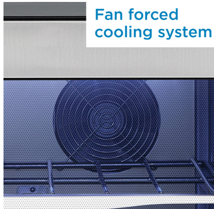
Fan forced cooling system