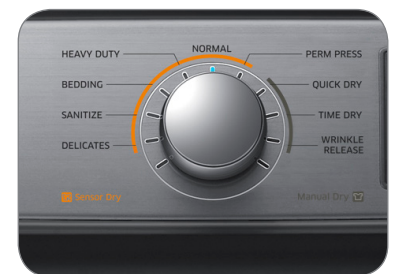
9 Drying Cycles