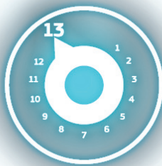
13 Drying Cycles