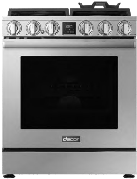
DOP30T840GS/DA - Silver Stainless, Natural Gas/Liquid Propane