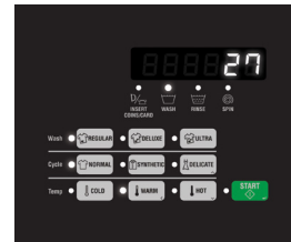
TV6 Control Panel

Speed Queen® coin drop top load washer and matching dryer combine heavy-duty construction with reliable operation proven to stand the test of time. With features such as water and energy efficient designs, quality internal components and high security systems, owners can depend on Speed Queen.