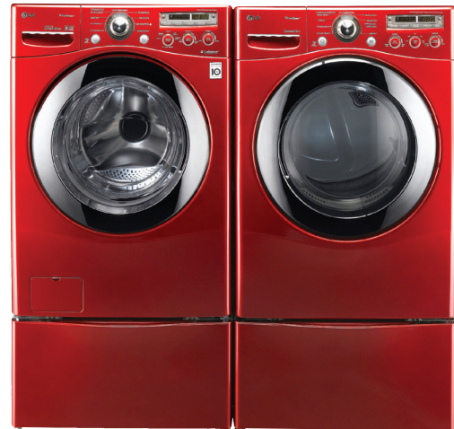
Wild Cherry Red