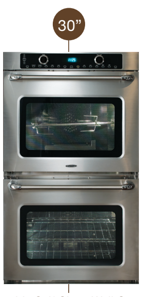
Double Self Clean Wall Oven MWOV302ES