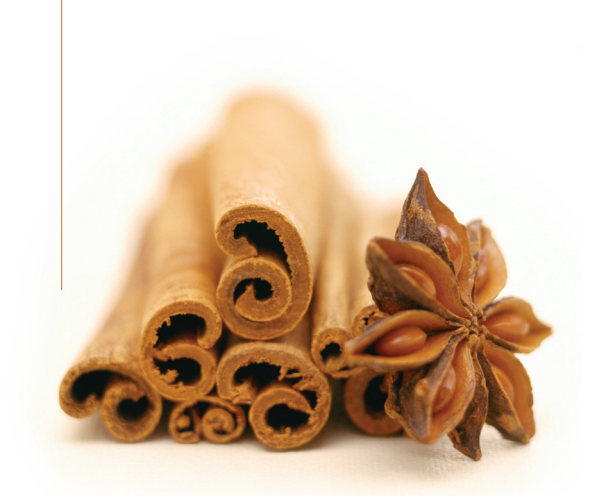
SPICE IT UP Whether you love your Pad Thai extra spicy, or prefer to walk on the mild side, the Power-Wok™ burner is a must. With even heat distribution and no hot spots, you'll get perfect results every time.