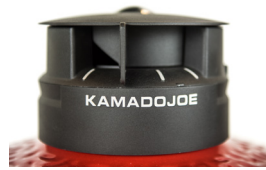
Kontrol Tower Top Vent