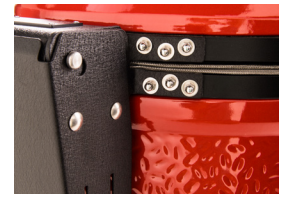
Air Lift Hinge