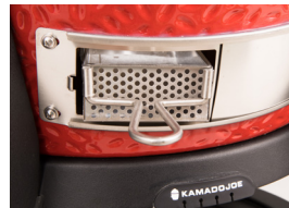
Patented Ash Collector