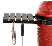
Aluminum Side Shelves