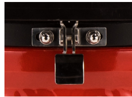
Stainless Steel Latch