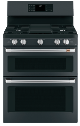
ALSO AVAILABLE IN