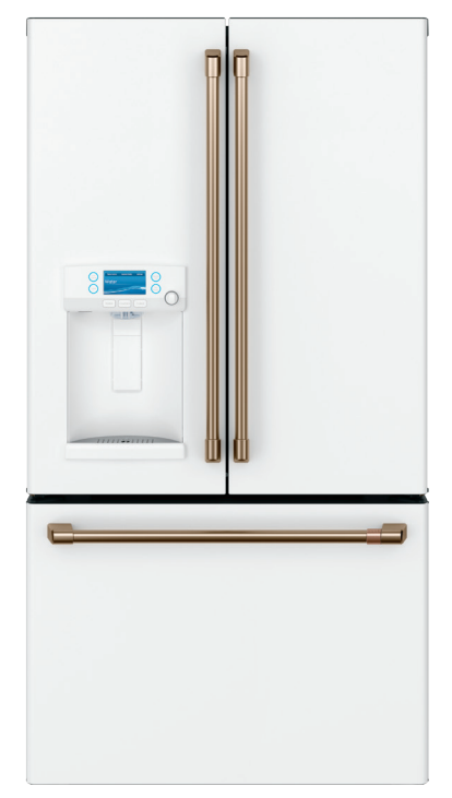
ALSO AVAILABLE IN