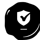
BOILER TANK LIFETIME WARRANTY