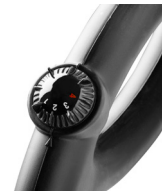
ADJUSTABLE STEAM AND HOT WATER SWITCH