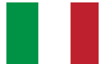
MADE IN ITALY