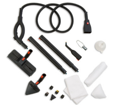
15-PIECE ACCESSORY KIT