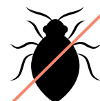
KILLS BED BUGS