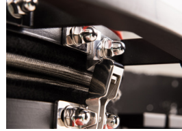
Stainless Steel Latch