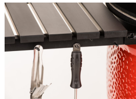
Aluminum Side Shelves