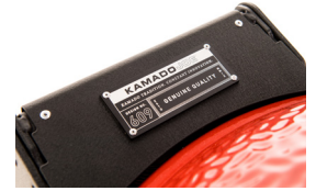
Air Lift Hinge