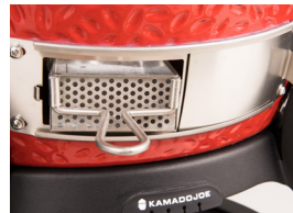
Patented Ash Collector