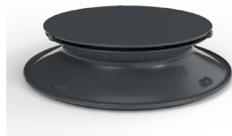
Patented Hyperbolic Insert