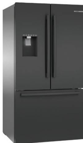
B36FD50SNB Black Stainless Steel