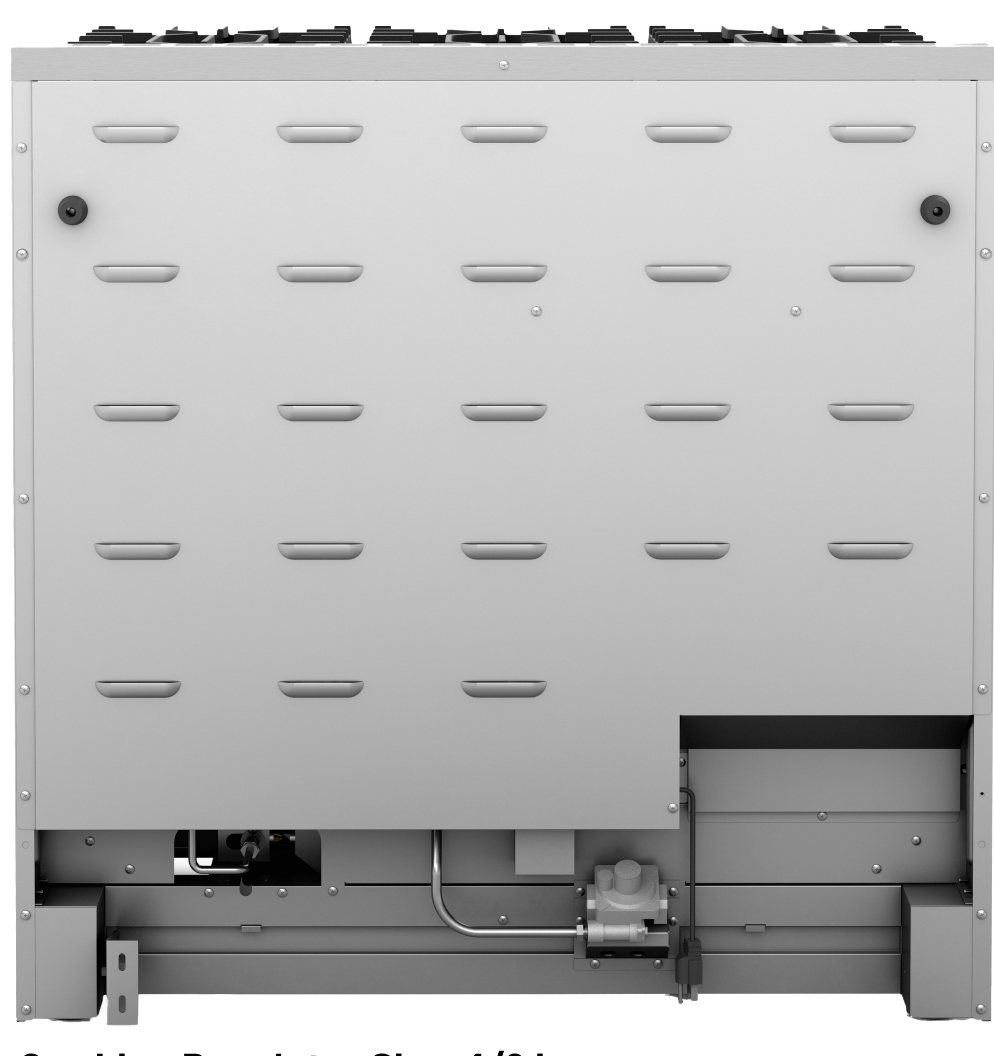
Gas Line Regulator Size: 1/2 in.

LP KIT includes orifices and gas regulator caps