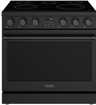
Product: 36-Inch Contemporary Professional Electric Range in Black Model Number: ARE36B