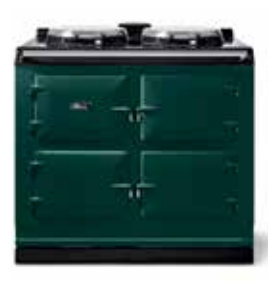
BRITISH RACING GREEN