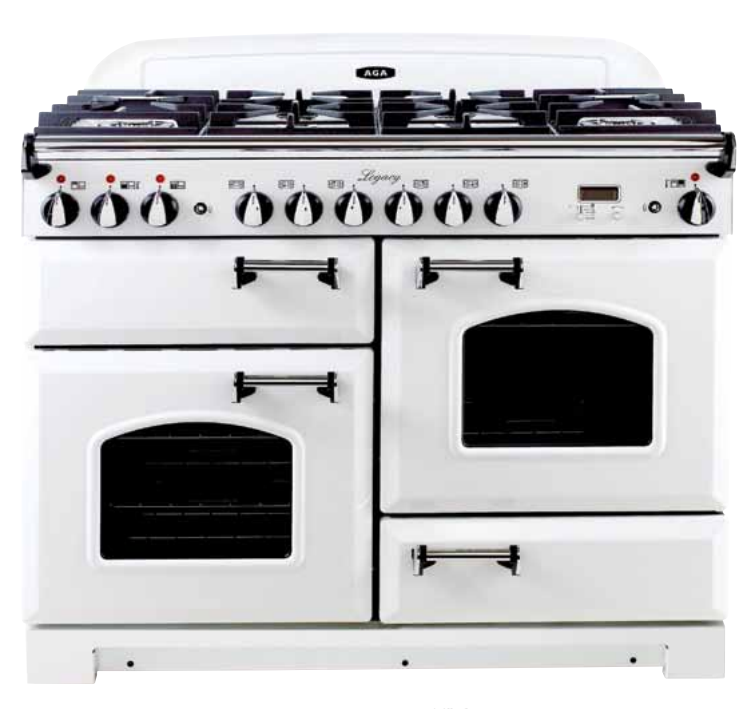
Legacy 44" Cathedral Door model shown in Vintage White (ALEG-44-DF-CD-VWT)