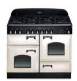
Ivory Legacy 44" Dual Fuel with Cathedral Door Model NO. ALEG-44-DF-CD-IVY