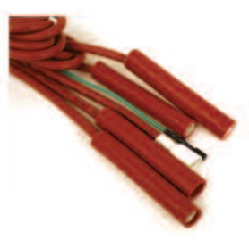
EXCLUSIVE HEAT PROTECTED WIRING Electrical wires are each encapsulated their full length with a 600° heat-resistance silicone sleeve, and all electric connectors are protected with a silicone boot of same heat resistance silicone.