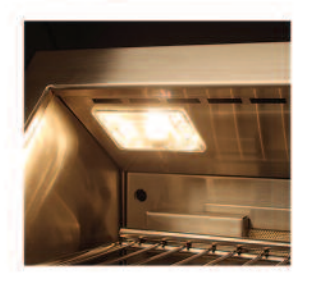
HALOGEN WORK LIGHTS Integrated high-intensity halogen work lights angle slightly toward the center for bright, even illumination. Light lens is easily removable without the use of tools for easily changing bulbs, and cleaning.