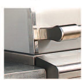
FIT AND FINISH With hand-polished accents, uniquely clean lines, and all heli-arc welded seams, the beauty and quality are in the details.