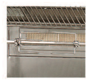
FLUSH INSET ROTISSERIE BURNER All Alfresco grills come with a flush-mounted 1500° rear ceramic infrared rotisserie burner.