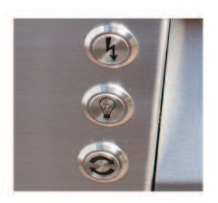
NEWLY REDESIGNED CONTROLS Stainless steel push-button ignition, lighting, and rotisserie controls are ergonomically integrated into the front control panel.