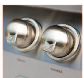
ATTRACTIVE NICKEL-PLATED ERGONOMICALLY-DESIGNED CONTROL KNOBS AND BEZELS The all-new grill knobs have been redesigned with precision touch in mind.