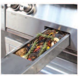
AND HERB INFUSION SYSTEM Dedicated 5.000 BTU stainless steel burner. Exclusive cold smoke capabilities. Drawer holds large chunks of wood, and linear defusing vents naturally eject smoke at 200° to food zone.

EXCLUSIVE HIDDEN AND Integrated 120 LB. Torque