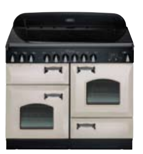
44" LEGACY (IVORY) † Electric Cooktop Cathedral Doors