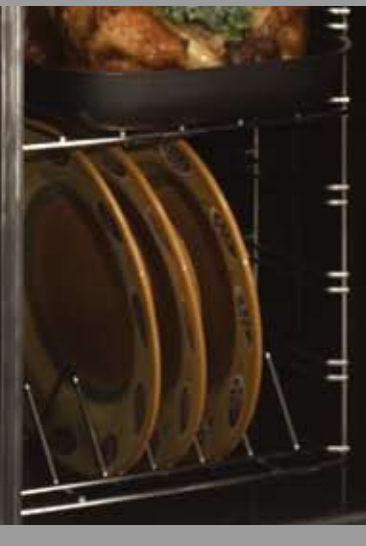
Plate Warming Rack

This programmable oven uses true convection, a cooking method that continuously circulates hot air through the cavity, for faster more even cooking. With 1.8 cu. ft. of capacity in the 36" model and 2.4 cu. ft. in the 44", this oven is large enough to prepare a whole meal, but small enough to heat up quickly and efficiently. The 36" model features four heavy duty oven racks and a removable plate warmer while the 44" includes three oven racks and a roasting tin.