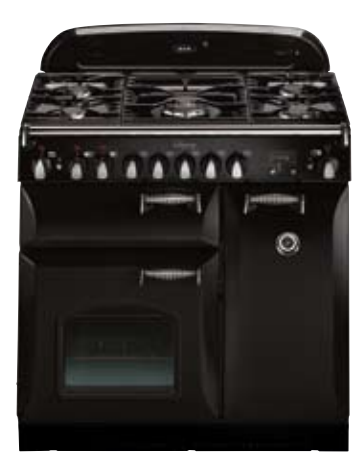
36" Dual Fuel Legacy with optional Cathedral doors in Black