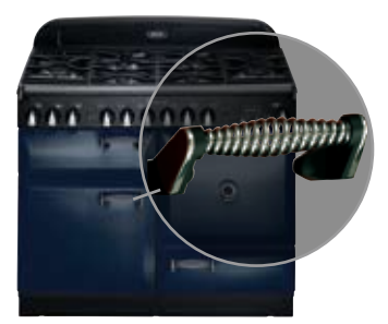
SPIRAL HANDLE (Standard on Black, Ivory, Cobalt, Cranberry and White models)