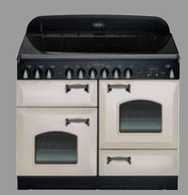
44" Electric Legacy with optional Cathedral doors in Ivory*