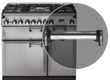
CLASSIC HANDLE (Standard on All White and Stainless Steel models)