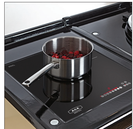
9" x 9" Defined Pan Area