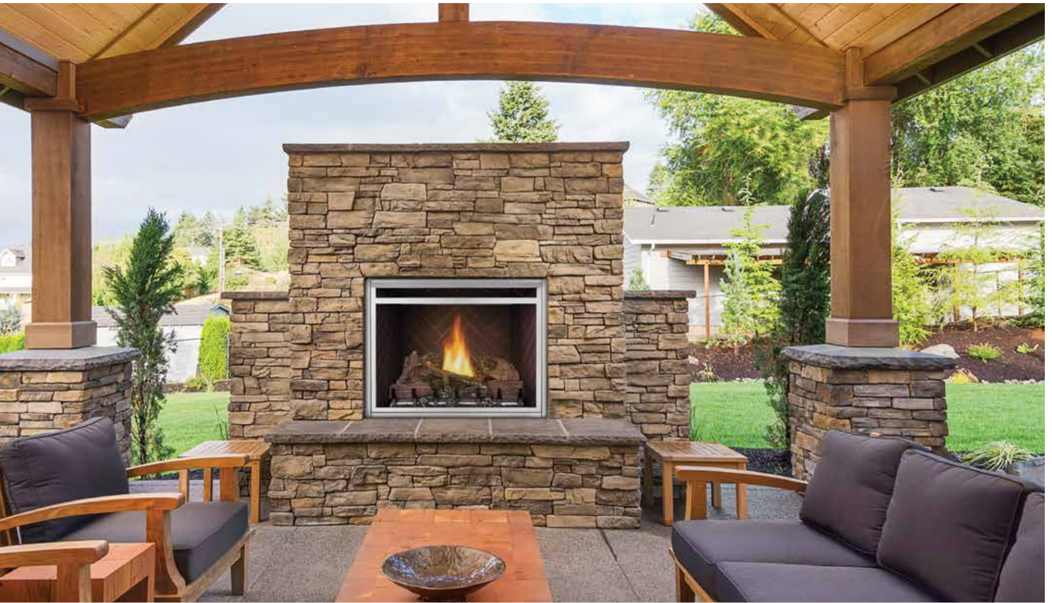
The Riverside™ 36 shown with stainless steel safety screen and Old Town Red™ decorative brick panels.