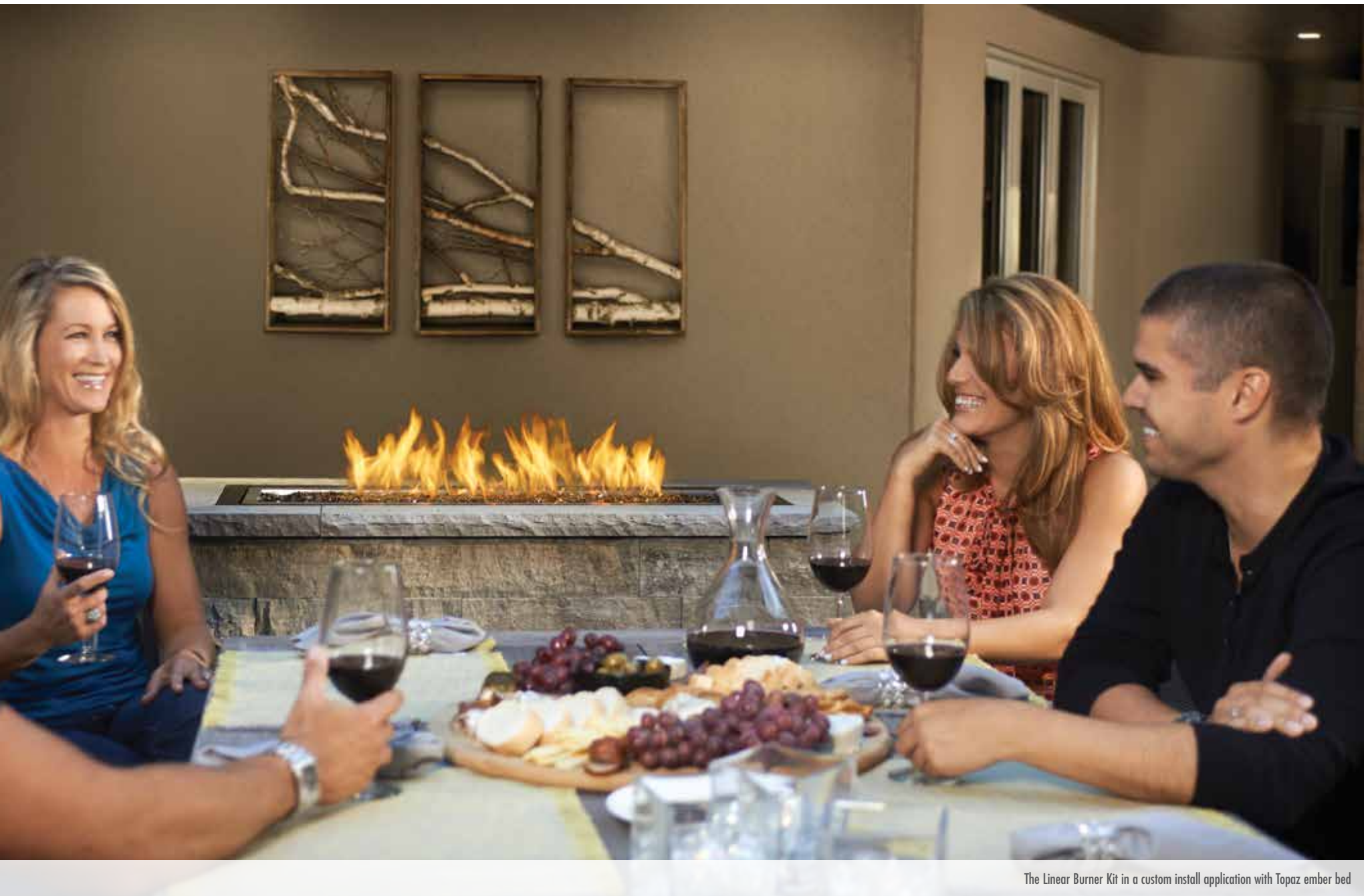
The Linear Burner Kit in a custom install application with Topaz ember bed