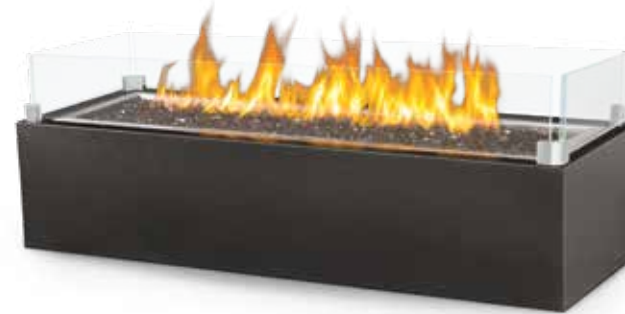
The Linear Patioflame® shown with standard Topaz CRYSTALINE™ ember bed and windscreen