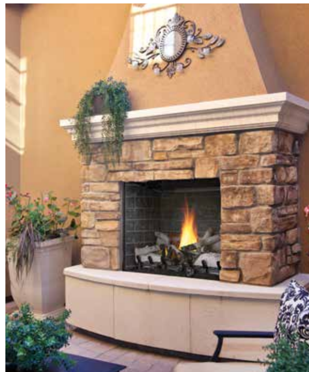
The Riverside™ 36 shown with Westminster Grey decorative brick panels.