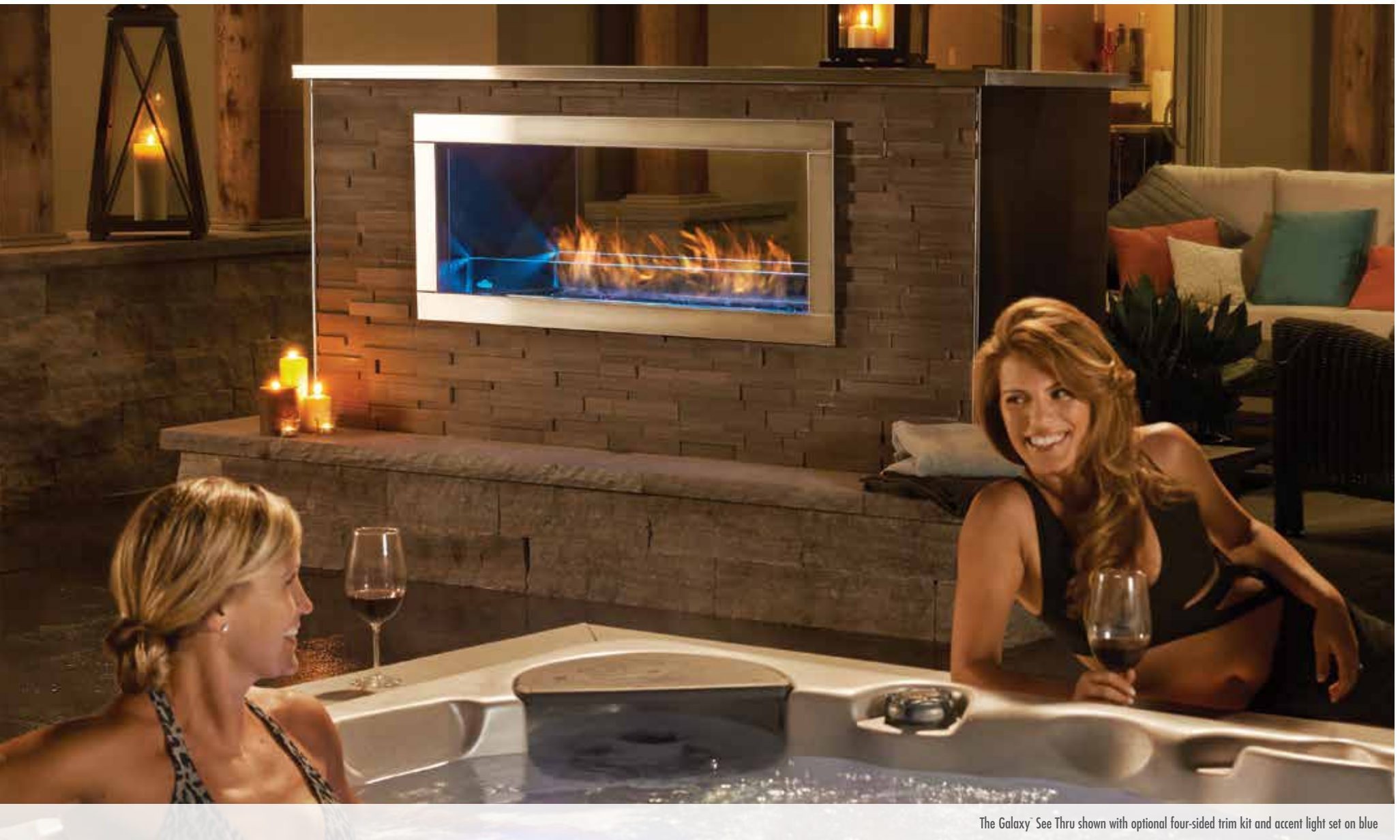
The Galaxy™ See Thru shown with optional four-sided trim kit and accent light set on blue