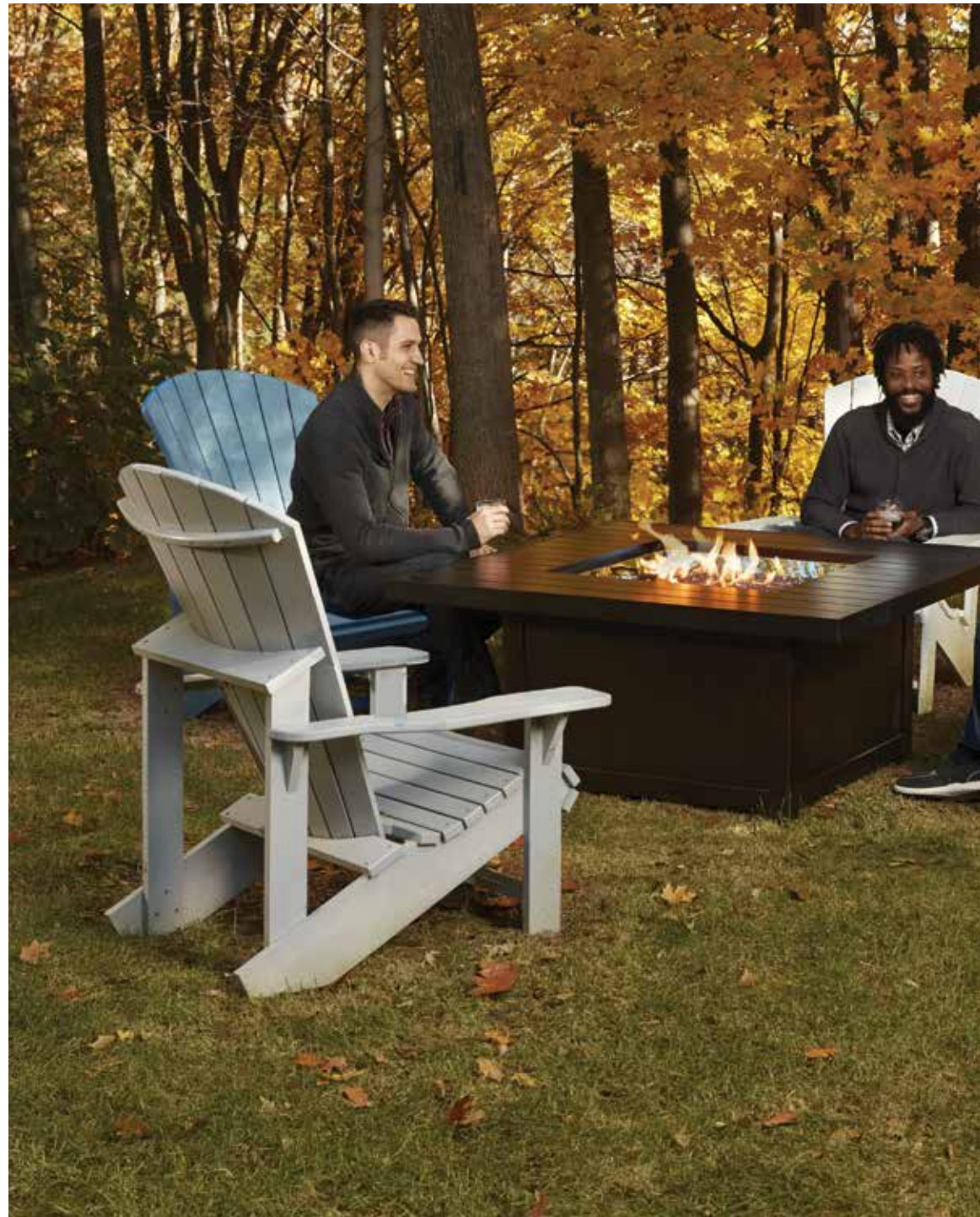
The St. Tropez Square Patioflame® Tables