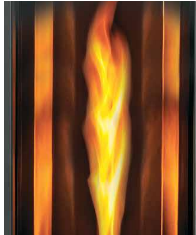
The Riverside Torch® flame pattern

Riverside Torch® - GSST8 6,000 BTU's 49 1/16"h x 15"w x 7 7/16"d Natural gas or propane