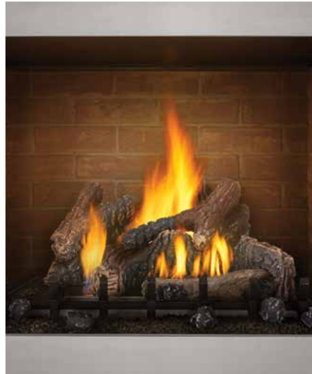
The Riverside™ 42 Clean Face shown with decorative sandstone brick panels