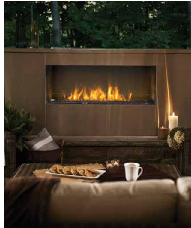
The Galaxy™ shown in a custom built-in stainless steel application