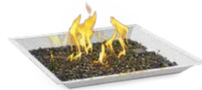
Square Burner Kit - GPFS60