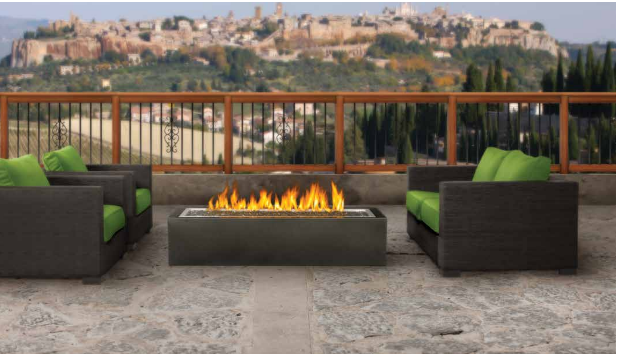
The Linear Patioflame® shown with standard Topaz CRYSTALINE® ember bed