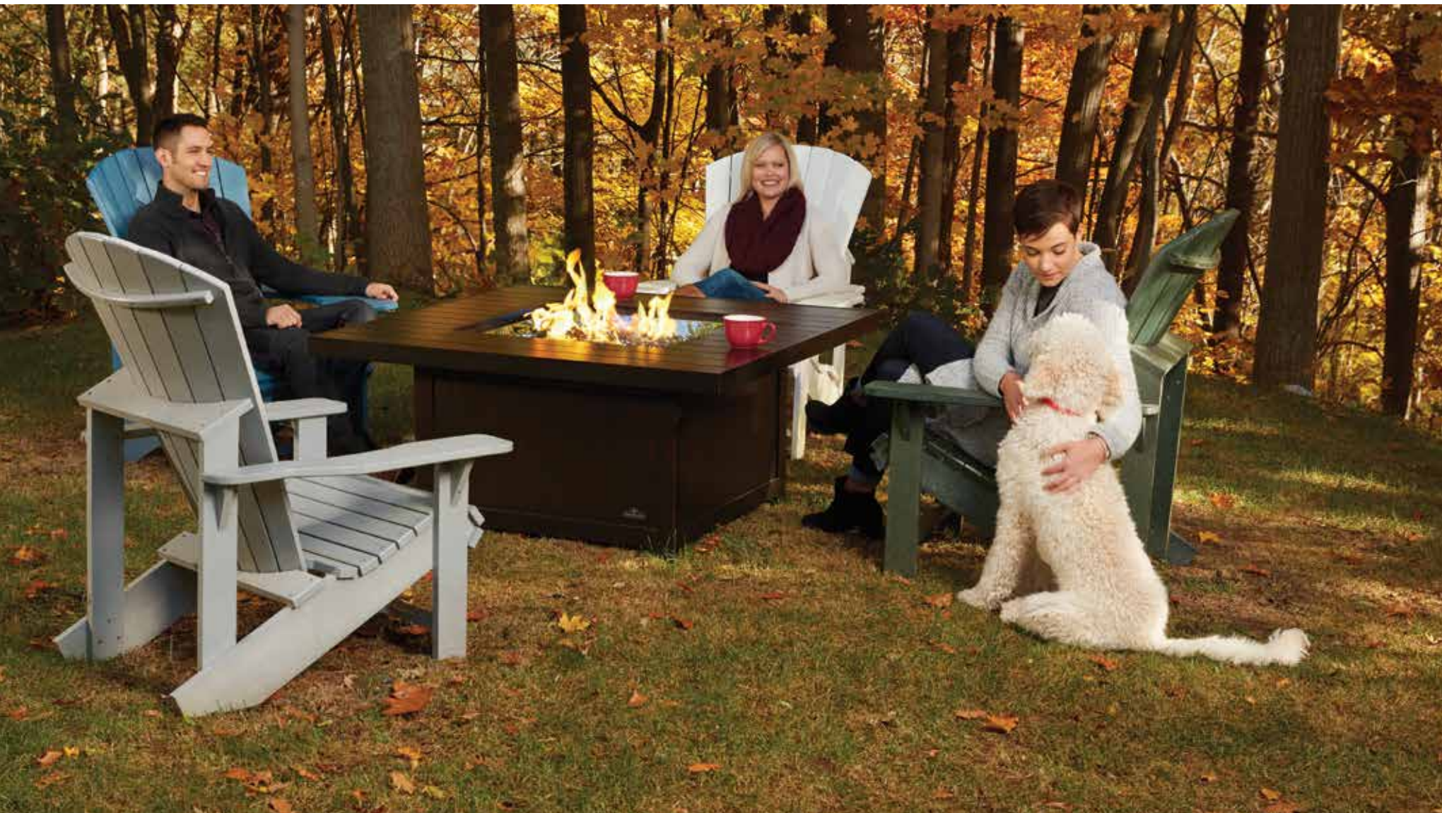
The St. Tropez Square Patioflame® Table