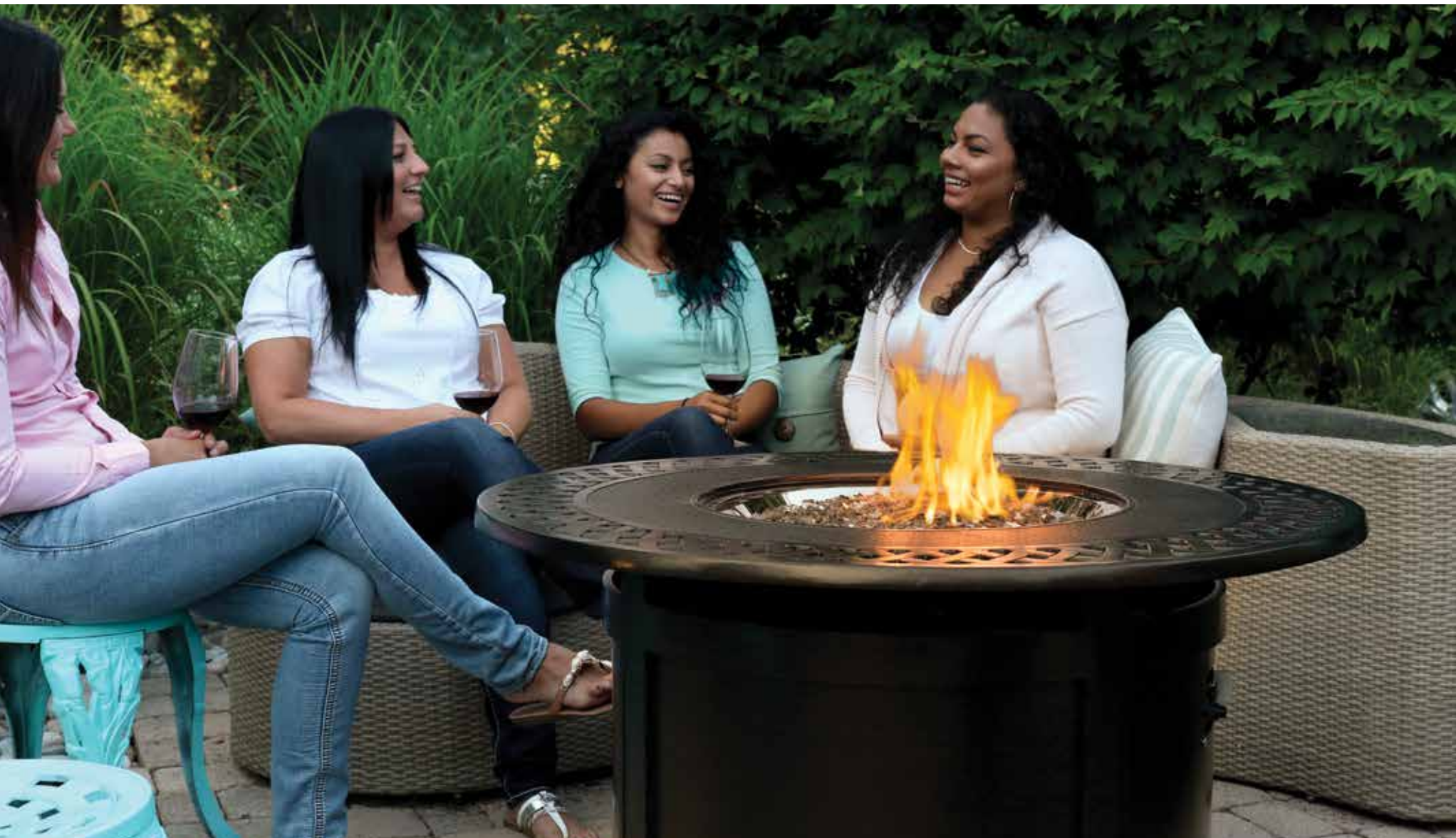
The Victorian Round Patioflame® Table