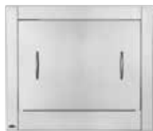
Stainless Steel Seasonal Cover (optional)