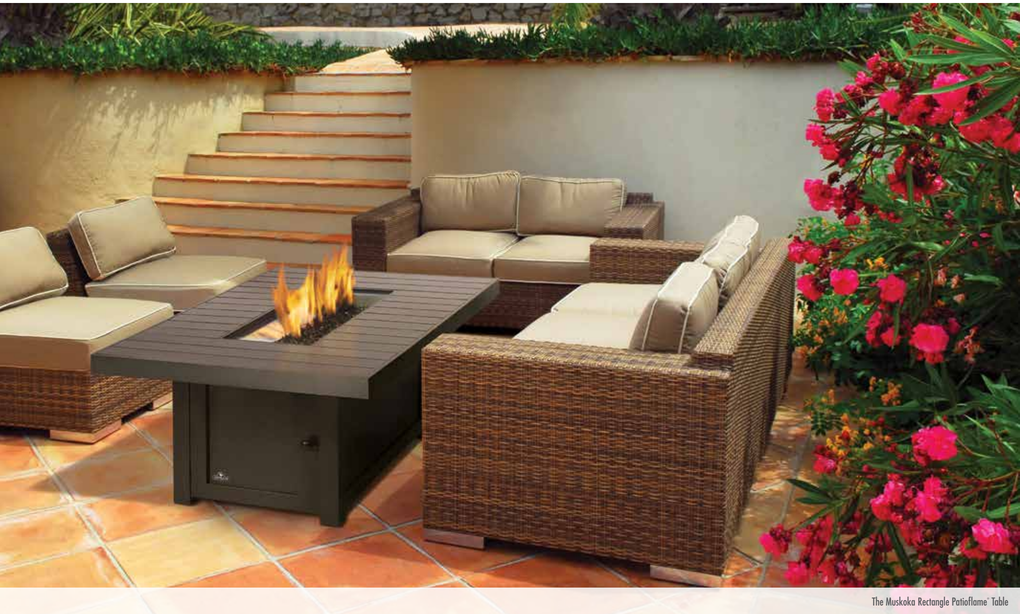
The Muskoka Rectangle Patioflame® Table