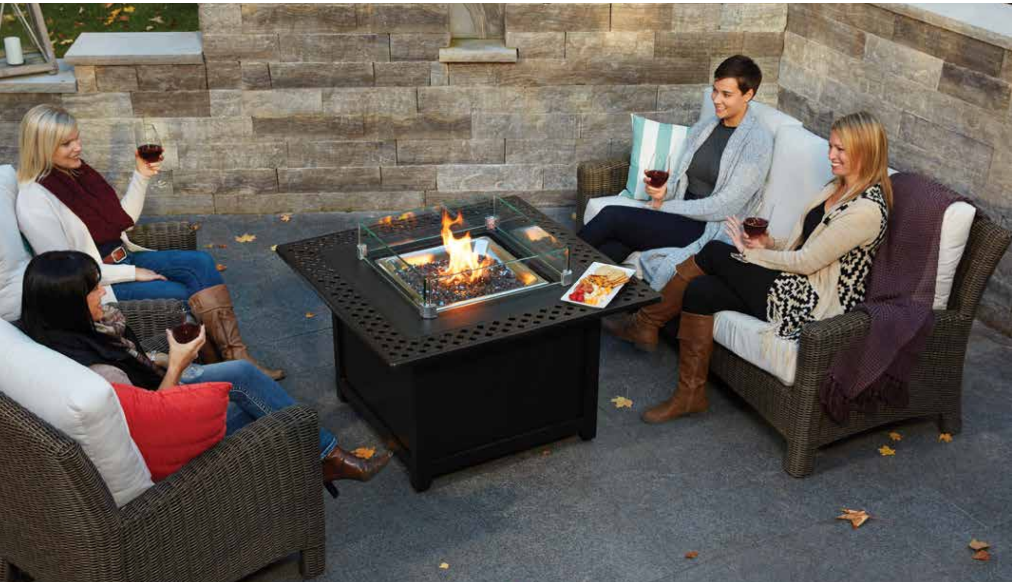
The Kensington Square Patioflame® Table