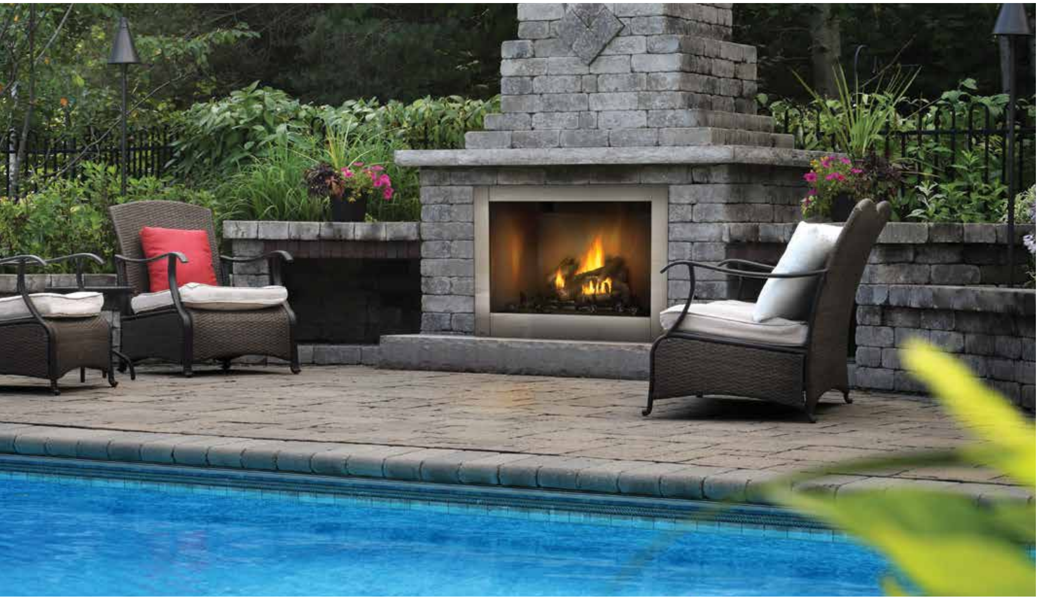
The Riverside™ 42 Clean Face