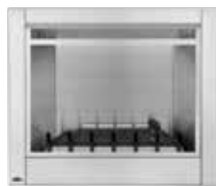
Stainless Steel Safety Screen (optional)