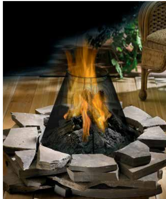
The Gas Patioflame® shown with GLOCAST® Log Set (GPF) and optional safety screen

Patioflame® Glass - GPFG 60,000 BTU's 4 ¾"h x 20" diameter Natural gas or propane