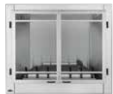
Stainless Steel Traditional Door Kit (optional)