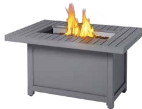
Rectangle - Grey