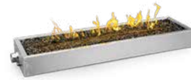
Linear Burner Kit - GPFL48

Consult your owner's manual for complete and up-to-date measurements and installation instructions for proper clearances to combustible materials.