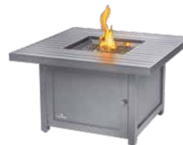
Square - Grey