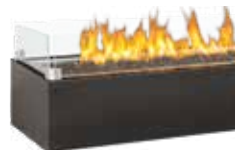
Glass Wind Deflector (optional)

* Cover is not for use with optional rock media kits.