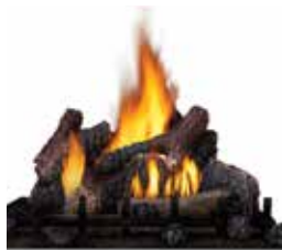
PHAZER® log set and embers (Included)