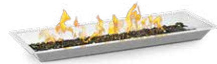
Rectangle Burner Kit - GPFR60