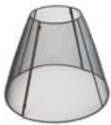
Safety Screen (optional)