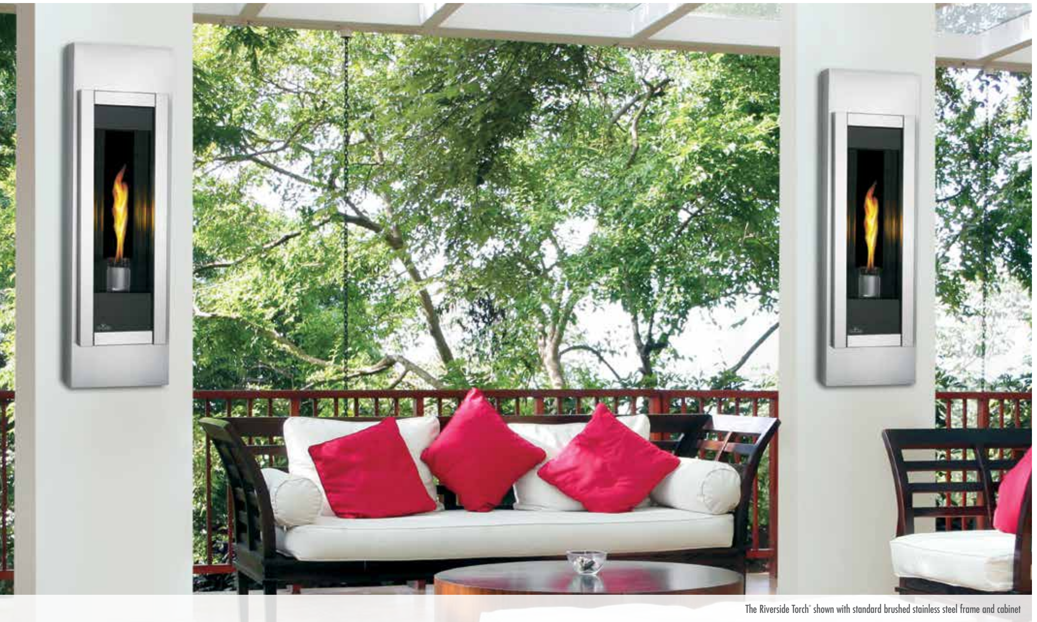
The Riverside Torch ® shown with standard brushed stainless steel frame and cabinet