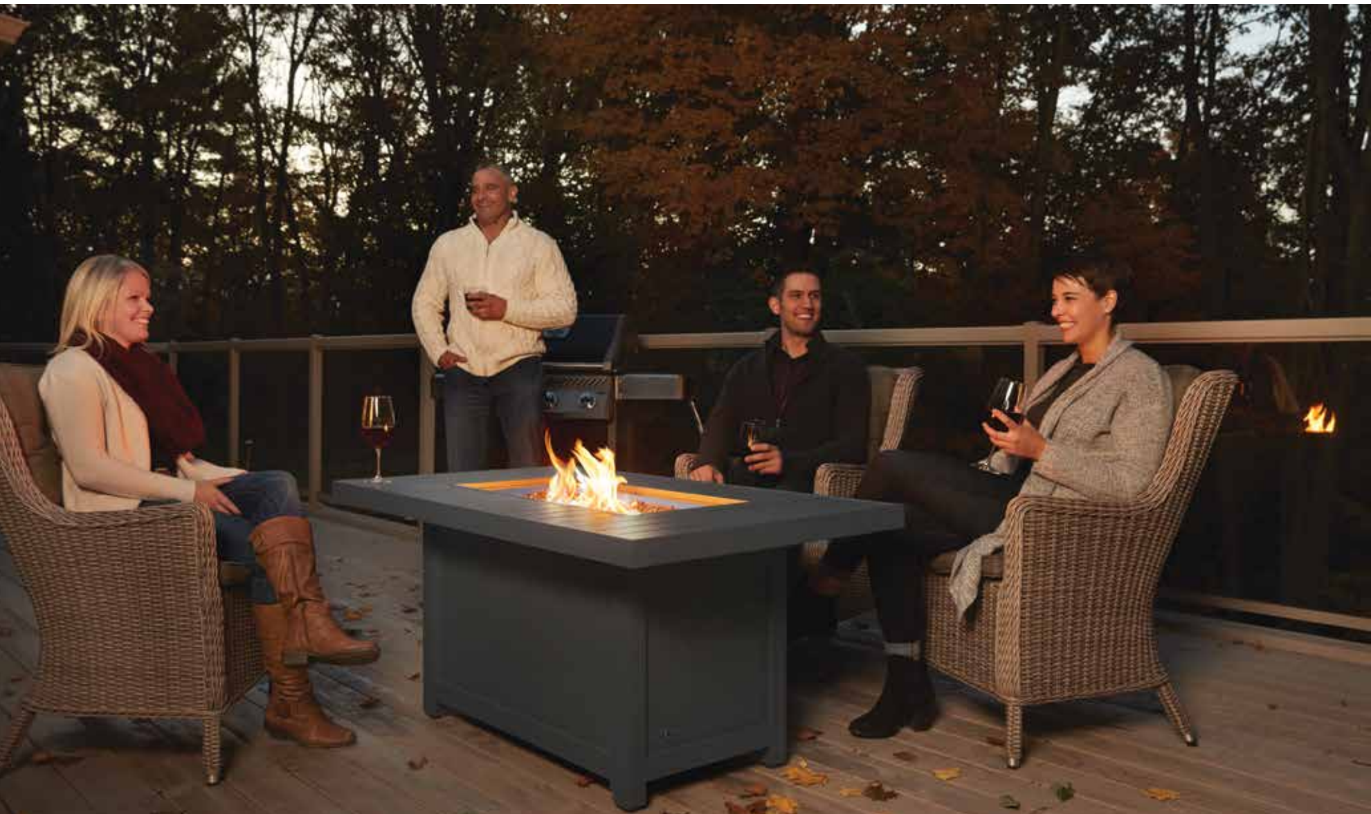
The Hamptons Rectangle Patioflame® Table