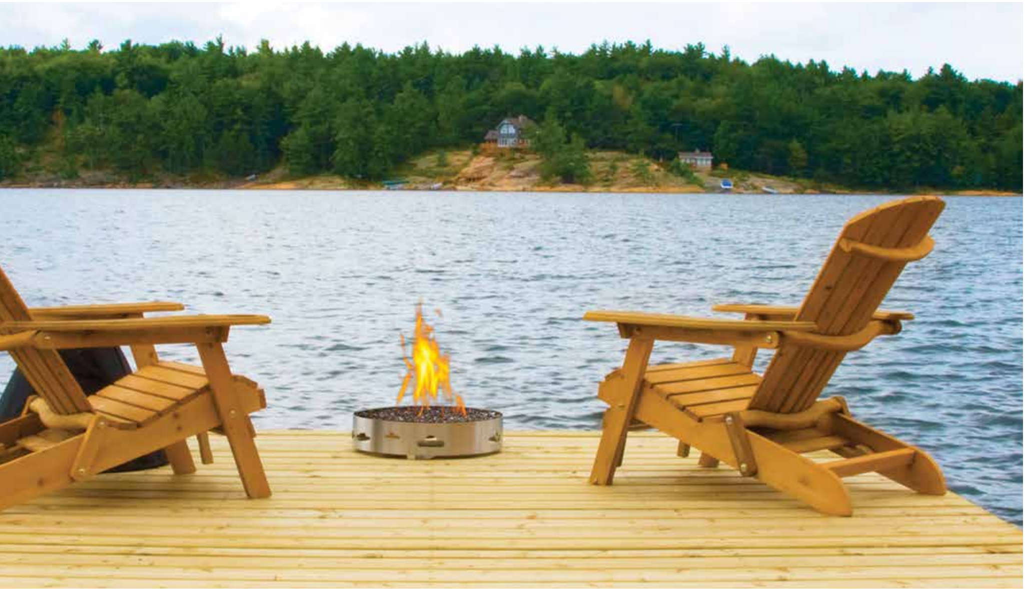
The Gas Patioflame® shown with Topaz CRYSTALINE™ Ember Bed (GPFG)