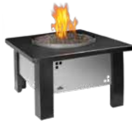
Table and Black Granite Top (optional)