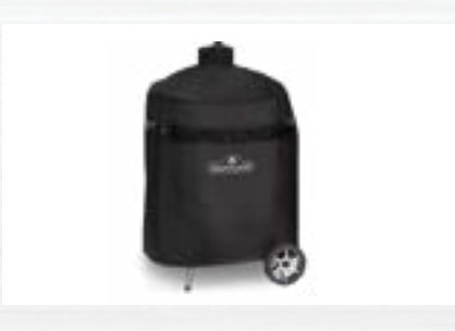
NK18K GRILL COVER (Fits NK18K-LEG 1) 61912