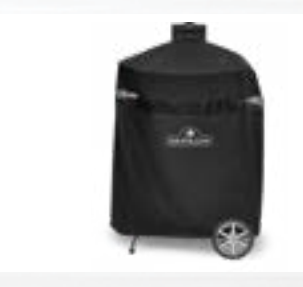
NK22K + PRO22K LEG GRILL COVER (Fits NK22K-LEG-2 & PRO22K-LEG-2)