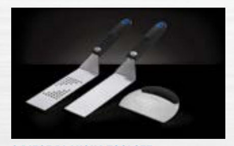
3 PIECE PLANCHA TOOLSET