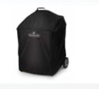
PRO22K CART GRILL COVER (Fits PRO22K-CART-2) 61911