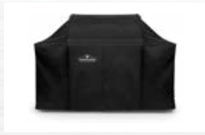
PR0605 GRILL COVER (Fits PR0605CSS) 61605