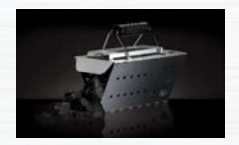
JETFIRE CHIMNEY STARTER