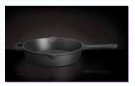
CAST IRON FRYING PAN