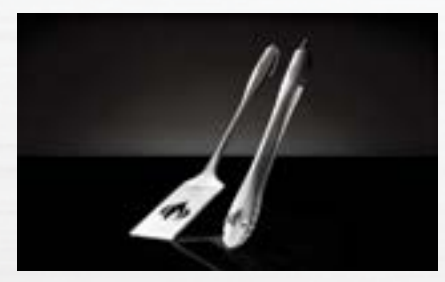
STAINLESS STEEL 2 PIECE TOOLSET