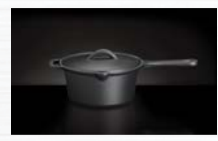
CAST IRON SAUCE PAN WITH LID 56051