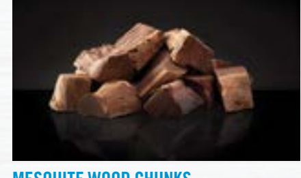
MESQUITE WOOD CHUNKS 67026

(Fits NK22K-LEG-2, PRO22K-LEG-2 & PRO22K-CART-2) 71022