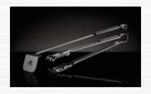
CHARCOAL RAKE AND TONGS