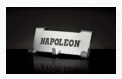
CHARCOAL KETTLE TOOL HANGER