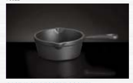
CAST IRON DESSERT COOKER