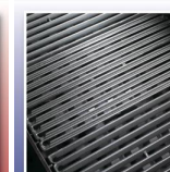
Heavy Duty Cast Iron Cooking Grids