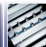
Stainless Steel Flav-R-Wave™ Cooking System