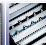
Stainless Steel Flav-R-Wave™ Cooking System