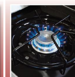
Powerful Side Burner