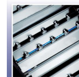
Stainless Steel Flav-R-Wave™ Cooking System