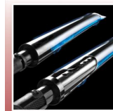
Stainless Steel Dual-Tube™ Burner System