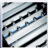
Stainless Steel Flav-R-Wave™ Cooking System