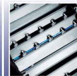
Stainless Steel Flav-R-Wave™ Cooking System