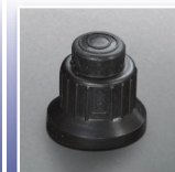
Sure-Lite™ Electronic Ignition System