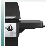
Weather Resistant Resin Drop Down Side Shelves