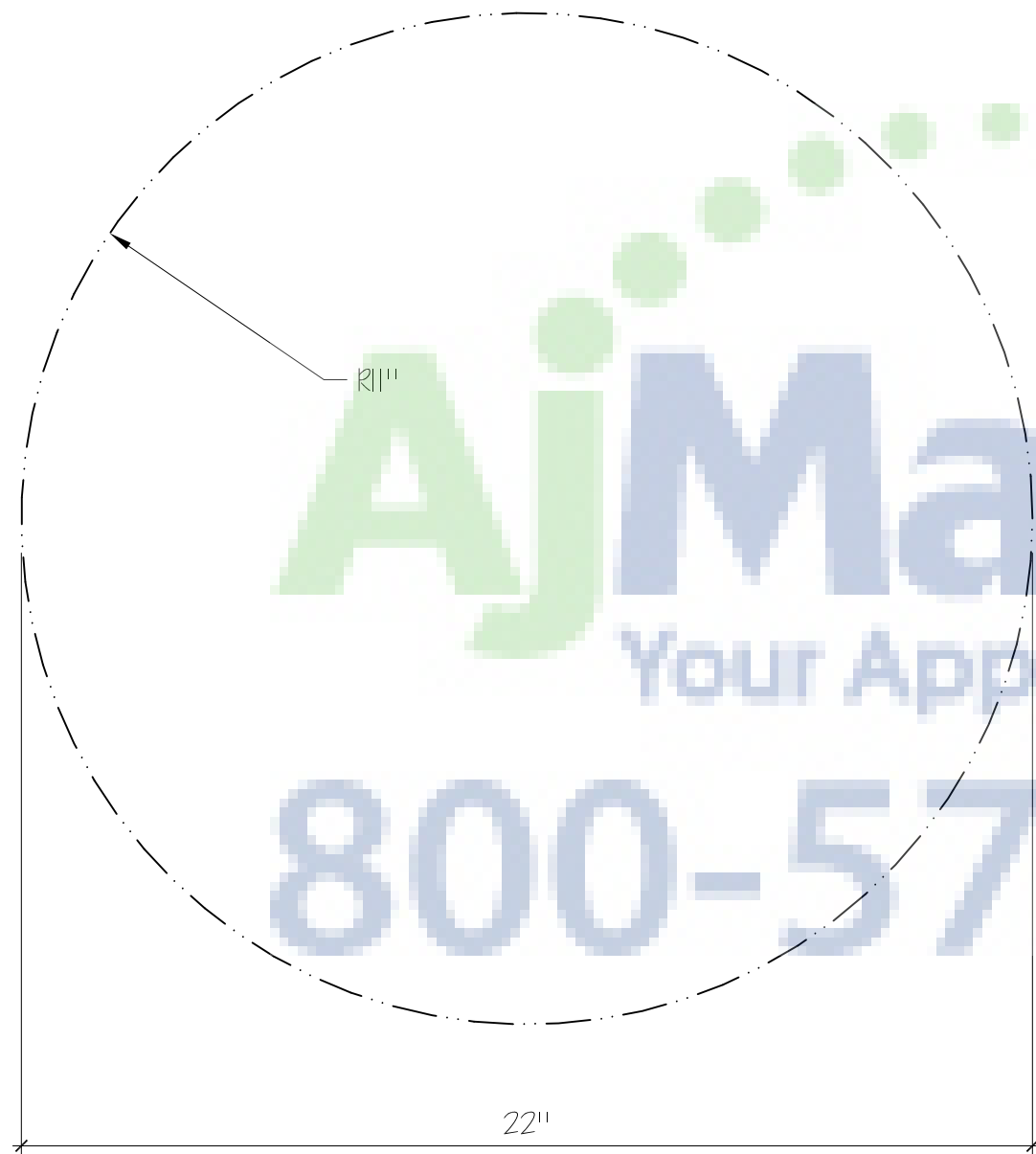
FIG. A - PLAN VIEW CUT-OUT