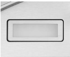
LED modules evenly illuminate cooktop with three intensities.