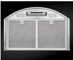
Quick release mesh filters ensure a clean, fresh kitchen.