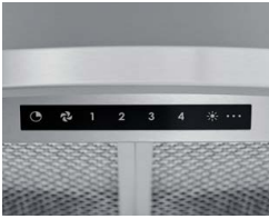
Tap-touch control features easy-to-clean surface.