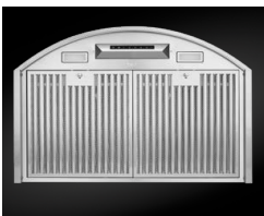
Upgrade to optional high-performance baffle filters.