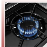
Powerful Cast Iron Side Burner