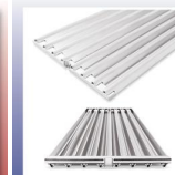
V-Shaped Stainless Steel Cooking Grids