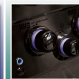
Built In Control Panel Lights