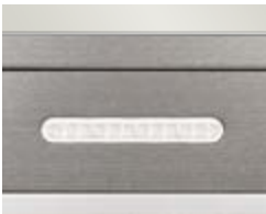
Brilliant three-level LED modules illuminate the cooktop. 3-year warranty.