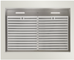
Hybrid baffle filters provide ultra-efficient grease removal with superior air flow.