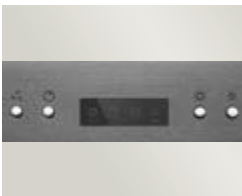
Three-speed electronic control includes 10-minute delay-off and filter clean reminder.