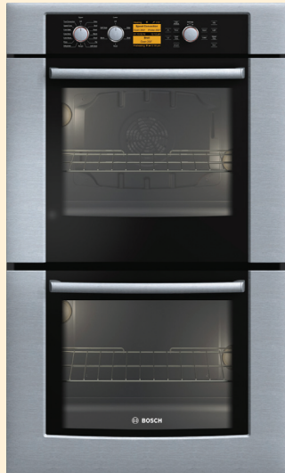
500 Series HBL56xUC Double Oven