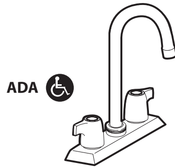
MOEN® Two Handle Bar Faucet