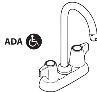
MOEN® Two-Handle Bar Faucet