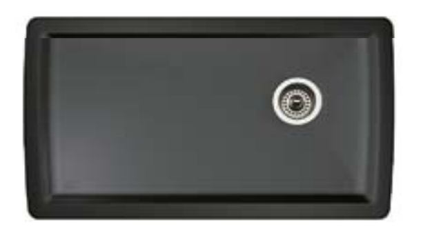
Model 441768 shown