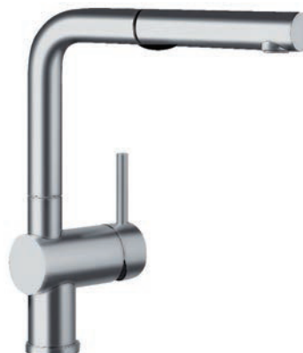
Model 441431 shown