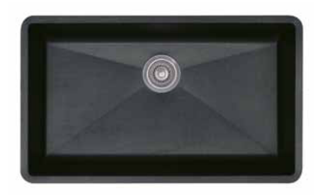
Model 440149 shown