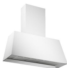
KMC36BI Matt white canopy