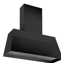
KMC36NE Matt black canopy