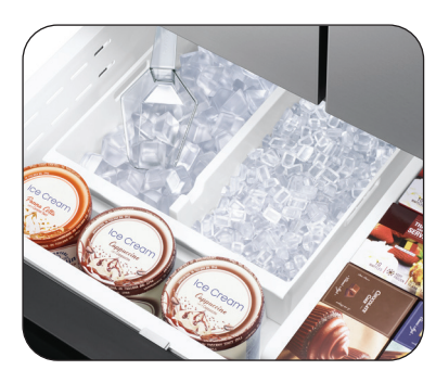
Dual Auto Ice Maker