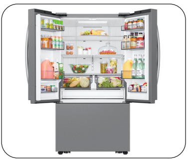
Large 32 cu. ft. Capacity