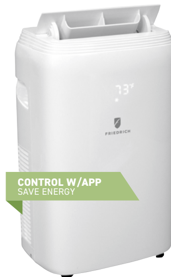
ZCP08SA, ZCP10SA, ZCP12SA