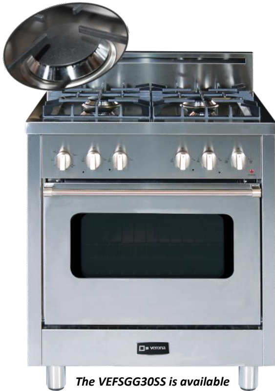
The VEFSGG30SS is available in Stainless Steel only.