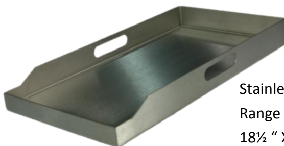
Stainless Steel Range Top Griddle 18 1/2" X 9 3/4" X 2" VEGRL100