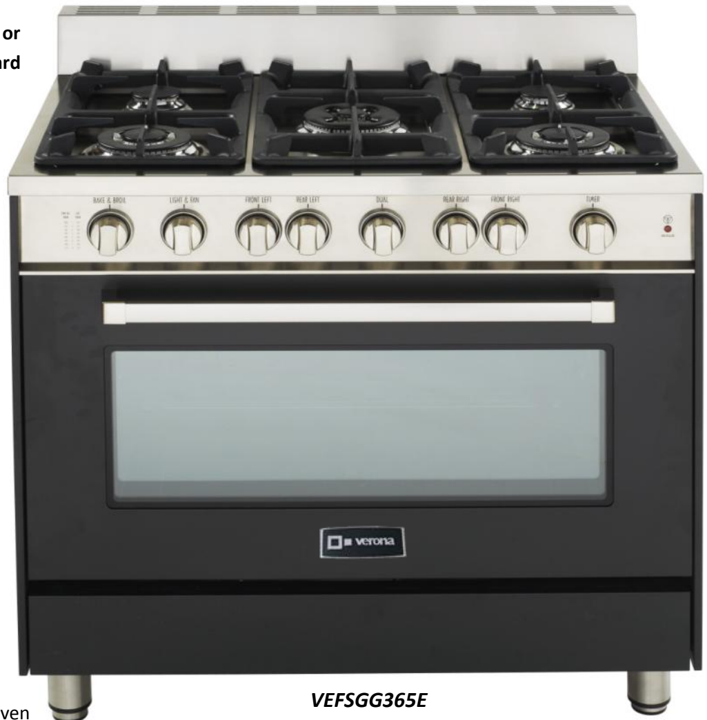
VEFSGG365E Shown with 4" extended backguard