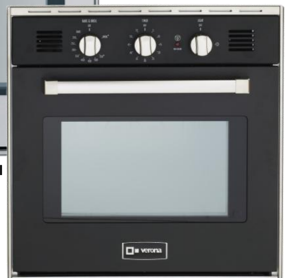
VEBIG24E - Matte Black

VEBIG24 is available in Stainless Steel and Matte Black