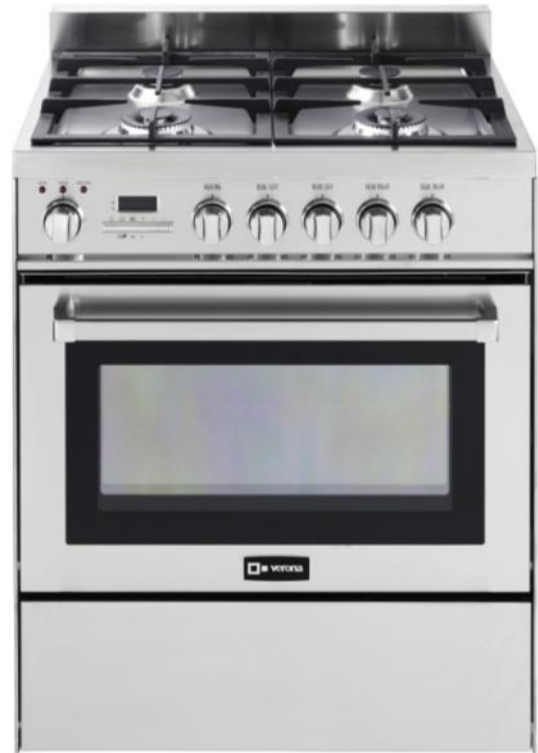
VEFSGE304SC with Drop Down Storage