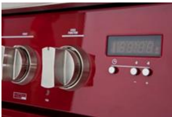
Digital Clock & Timer