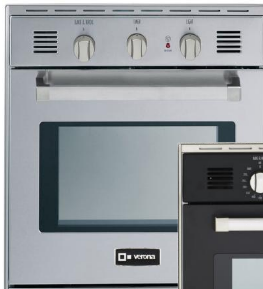
VEBIG24SS - Stainless Steel