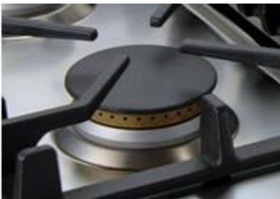
High Powered German Brass Burners