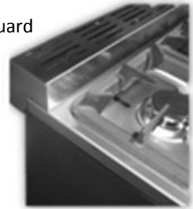
Shown with 2" extended back guard

Extended back guard adds 1 7/8" to the overall depth