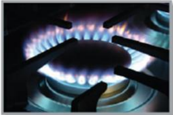
450 - 18,500 BTU Dual Simmer Burners