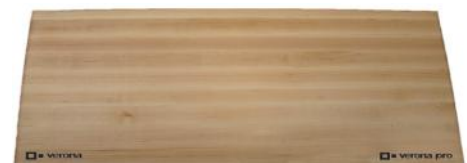
Cutting Board - VECB9171 9 1/2" X 17 1/4" X 1" Seats inside VEGRL100 Griddle