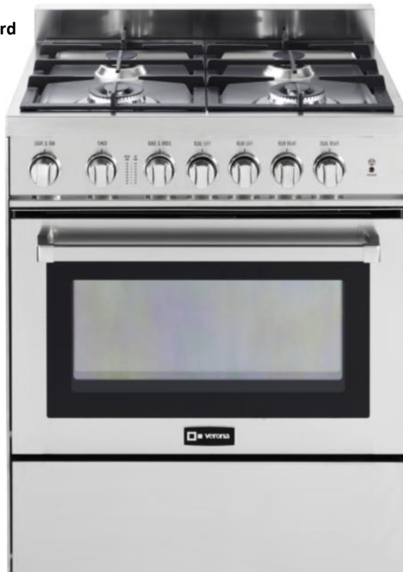
The VEFSGG304 Series is available in Stainless Steel, Matte Black, Burgundy and Antique White (Bisque).