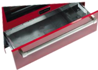
Thermostatically Controlled Warming Drawer