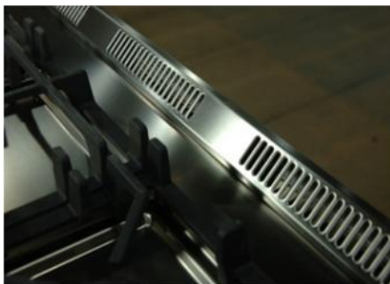
2" Island Trim - Verona Pro VEITM36