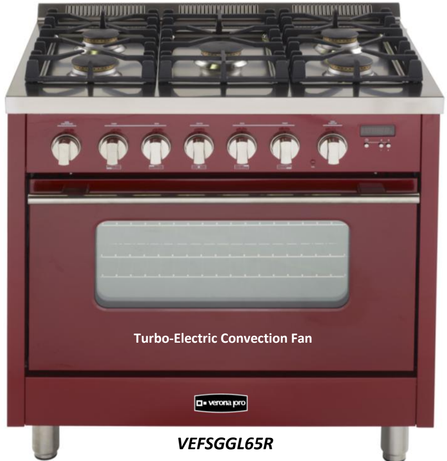
Turbo-Electric Convection Fan