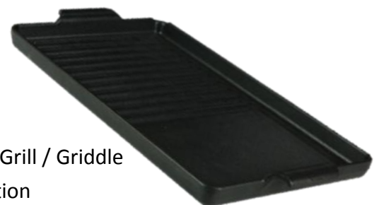
Cast Iron Grill / Griddle Combination 15" X 9 3/4" VEGRD100C