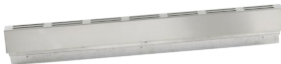
3" Island Trim available on all Verona 36" Single or Double Oven Ranges - VEITE36