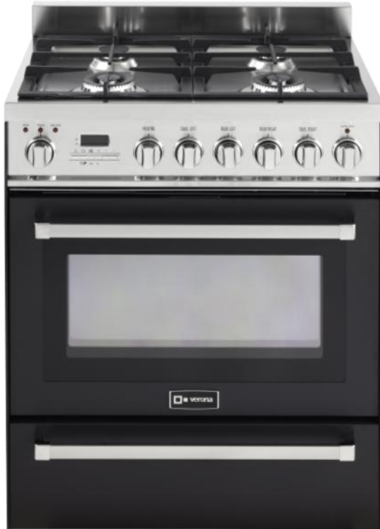
VEFSGE304P with Warming Drawer