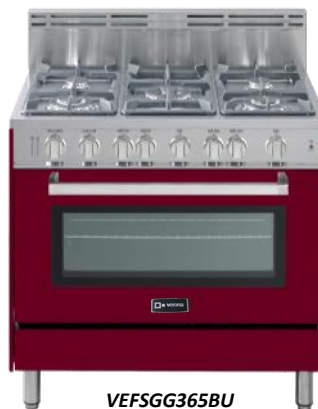
VEFSGG365BU Shown with 8" high standard depth backguard