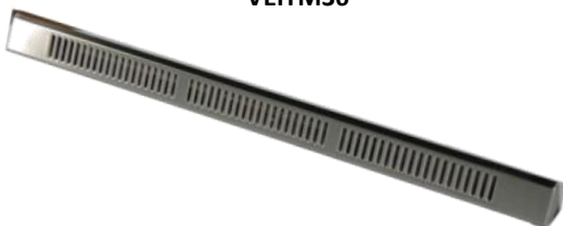
Island Trim Available VEITM36