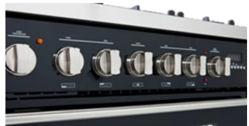
Stainless Steel Knobs, Bezels and Handle