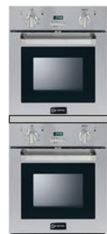
Optional Stacking kit