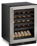
STAINLESS FRAME (LOCK)