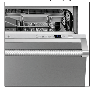
Stainless steel racks