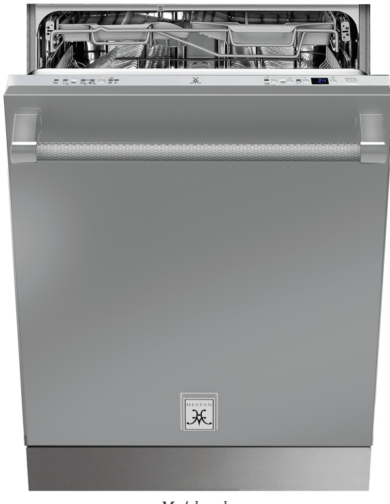
Model as shown KDW24